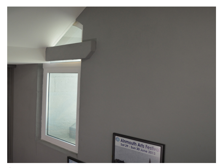
for cleaning and maintenance.

Fenestral, partner of Selectaglaze, managed the surveying and installation of the project. Using laser measuring equipment, 3D information was produced for the manufacturing of the timber grounds and casements. The tall lancet windows posed a challenge due to their height; 3350mm. Each of these openings were built up with a Series 41 side hung casement set between two Series 40 fixed light units. The timber grounds were crafted on site by experienced installers and scribed to ensure the tightest fit for the secondary glazing. One of the smaller lancet windows had to be split, due to access and its location part way up a stairwell.